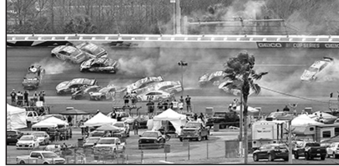
Big wreck on Lap 14.

Cindric in overtime time after taking over second place from Harrison Burton, the third-place finisher.